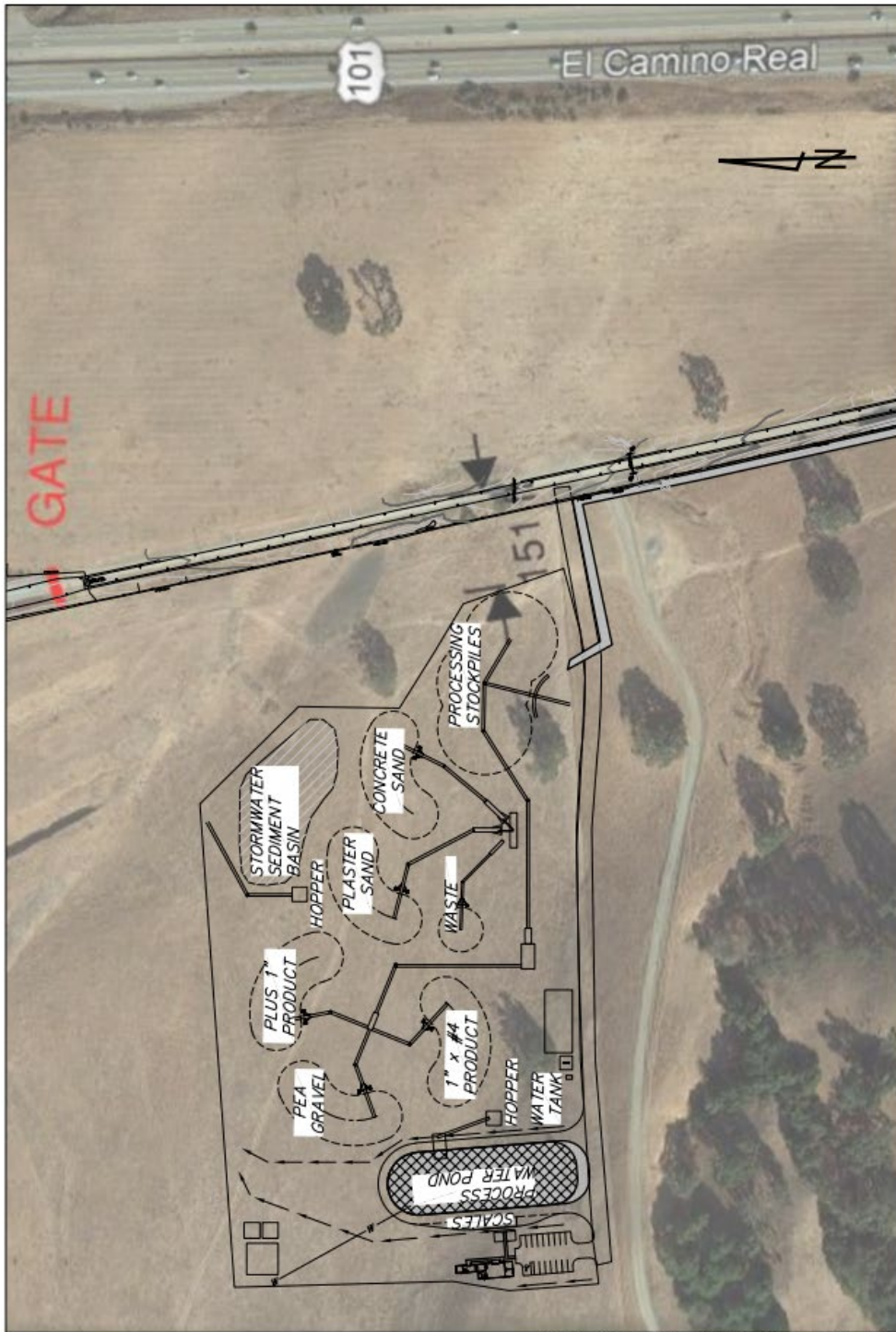
Figure 4-1; Alternative 3 Alternative 2 and 3, Processing Plant Relocation