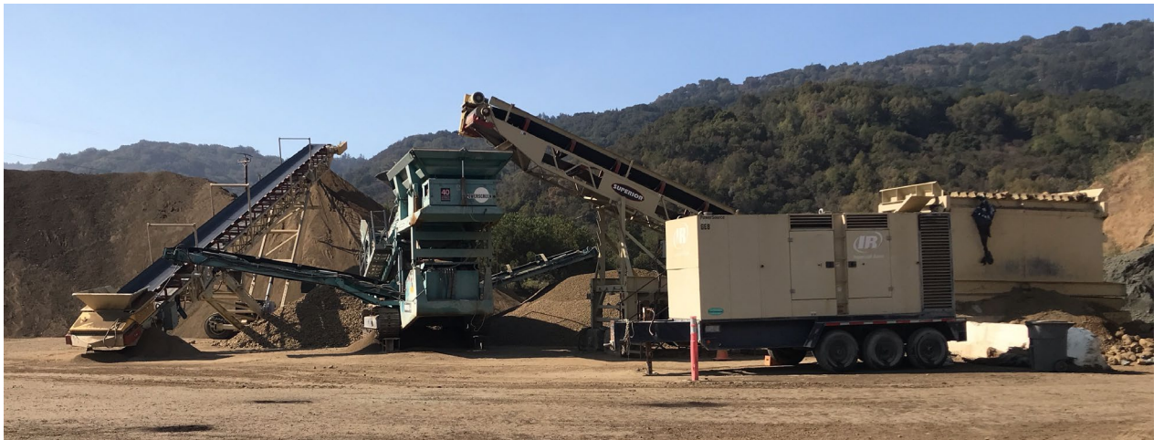
Photo 24: Dirt stockpile and processing equipment at eastern portion of Parcel A.