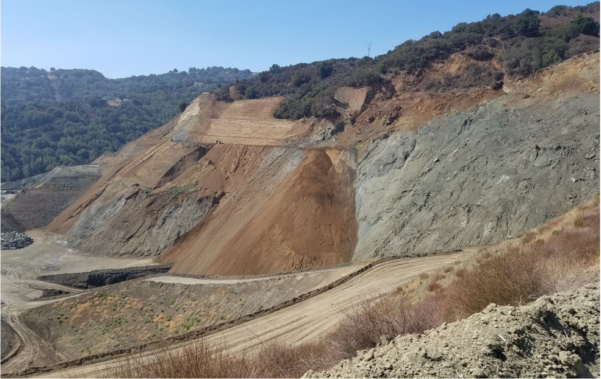
Photo 19: Slope failure on southwestern high cut wall, looking south. (Profile view)