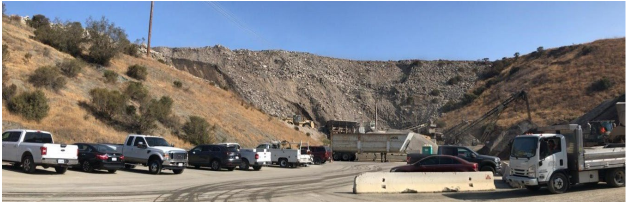
Photo 25: Recycle stockpile has been reduced in size since last year.