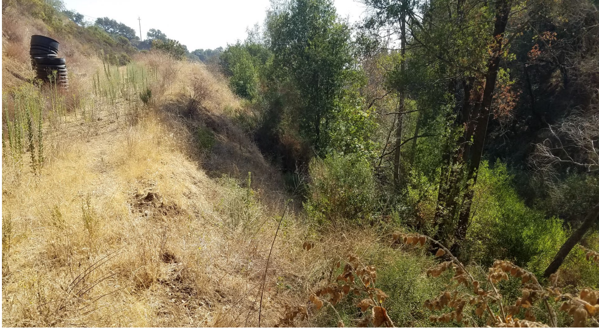
Photo 21: Reggraded slope along the north side of Rattlesnake Creek.