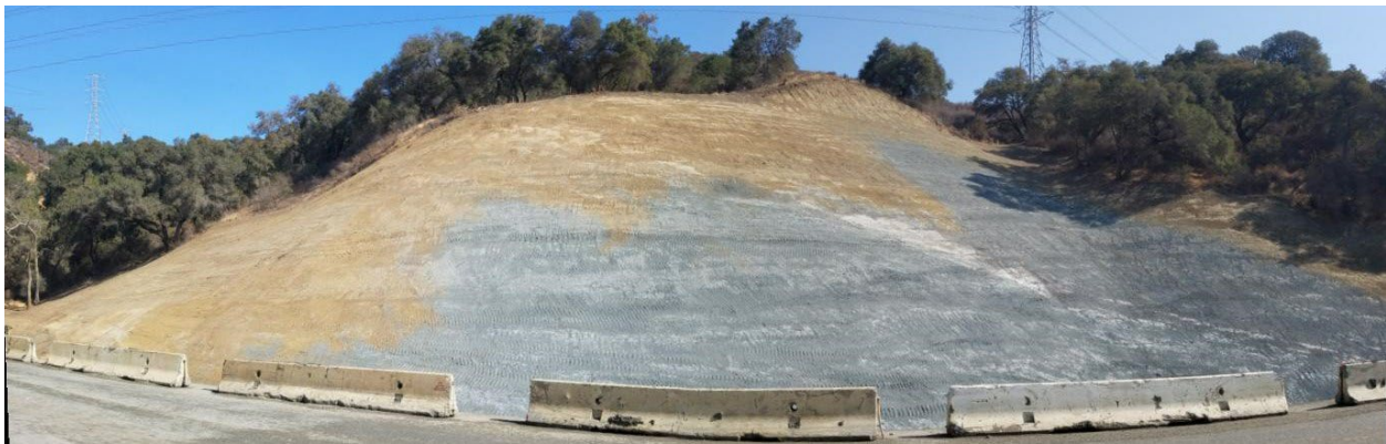
Photo 3 I b: Cut slope above recently graded BAGG basin (looking North).