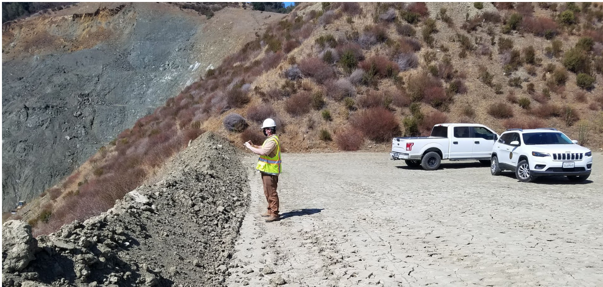
Photo 12: Ground crack on east-facing fill slope near northeastern corner of property.