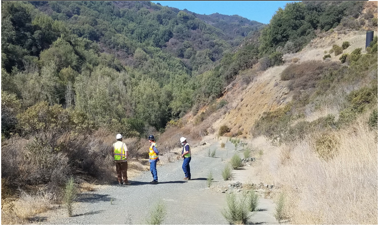
Photo 30: Check dams along road by northside of Rattlesnake Creek.