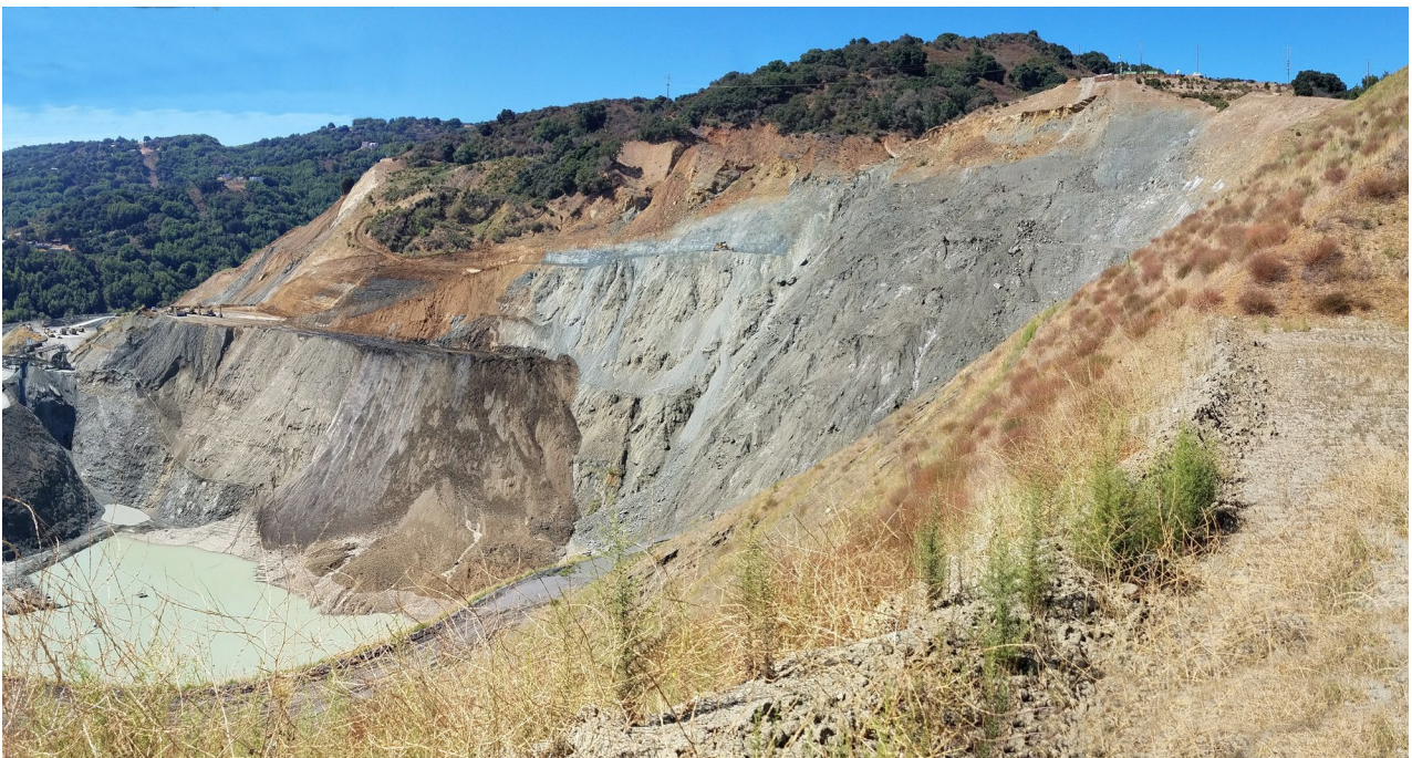
Photo 14: Buttress fill on north high wall. West side of pit visible on the left.