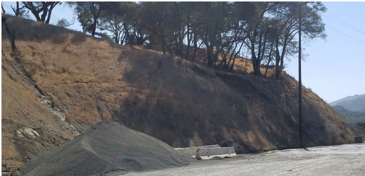
Photo 22: Shallow failures of cut slope along east side of Parcel B.