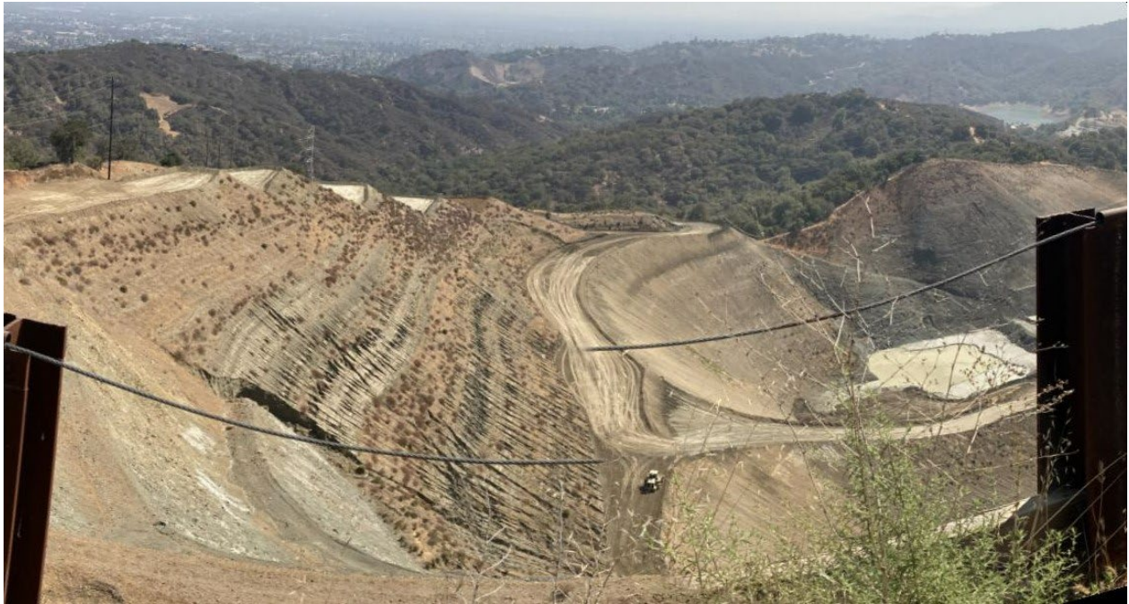
Photo 15: Panorama of buttress fill below retaining wall on northwest high wall.