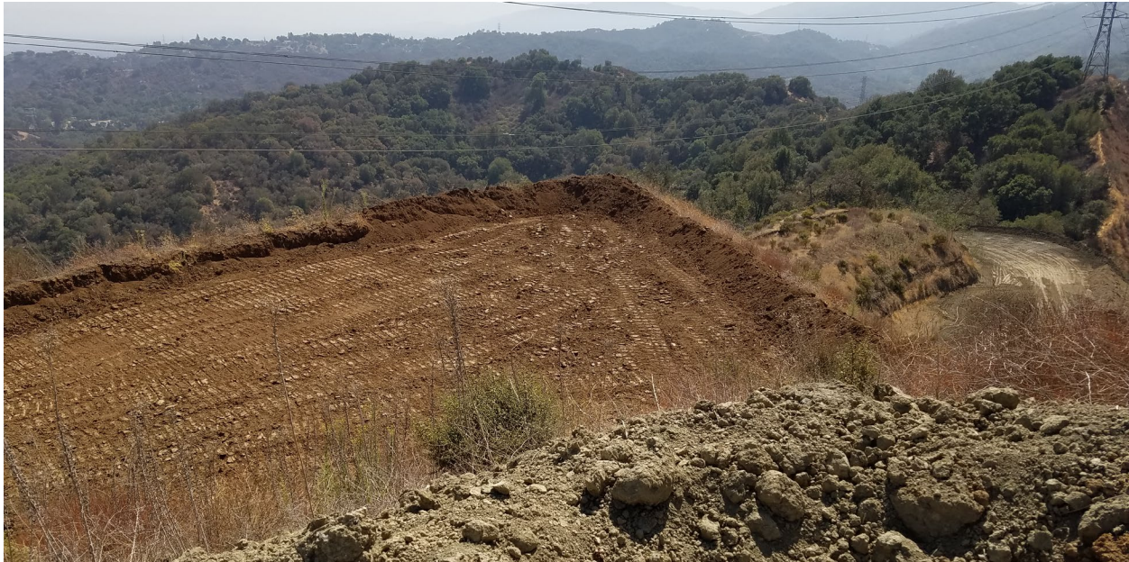
Photo 11: Regraded area where ground cracks on top of buttress fill of north high wall were observed during 2020 inspection.