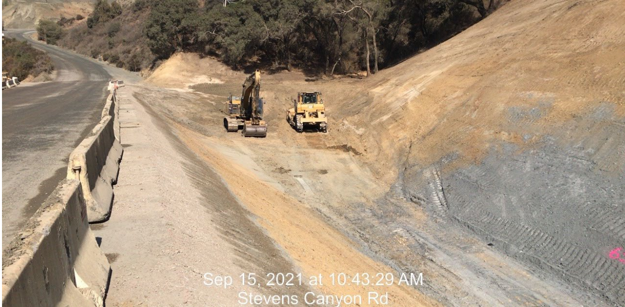
Photo 3 I a: West end of recently graded settling basin (known as BAGG basin) installed to comply with RWQCB requirements.