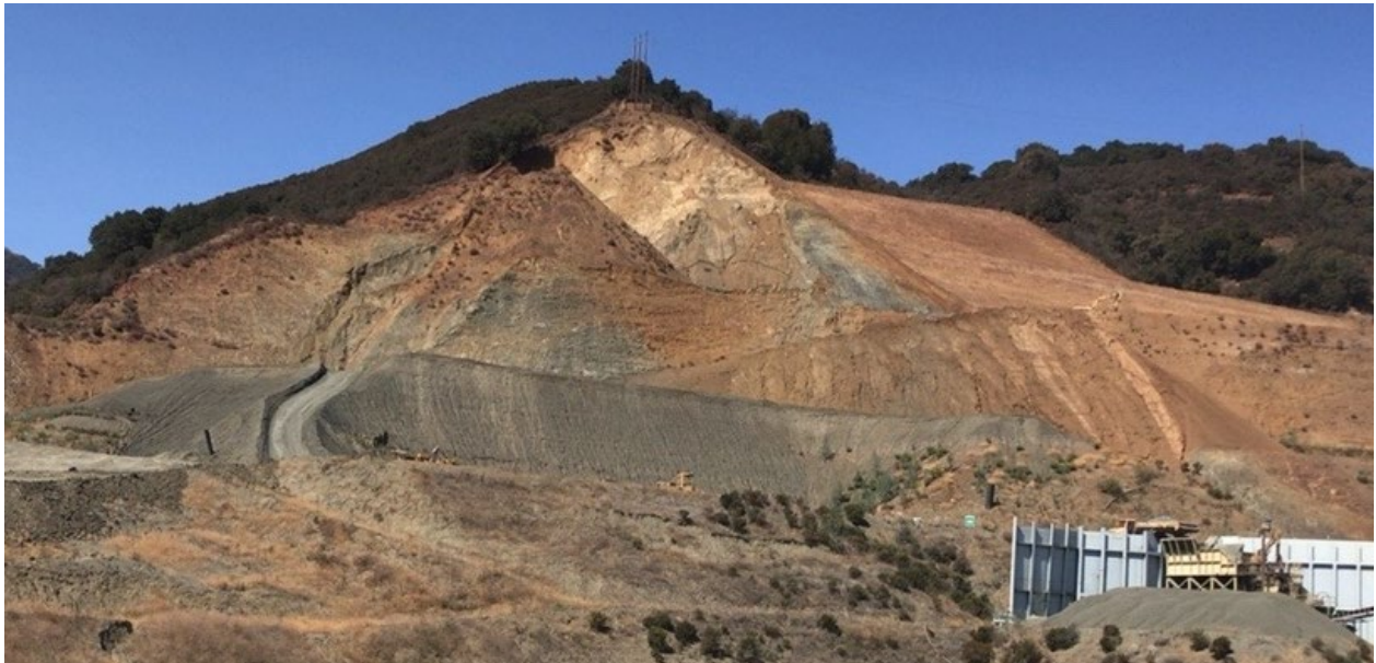
Photo 20: Slope failure on southwestern high cut wall, looking west.