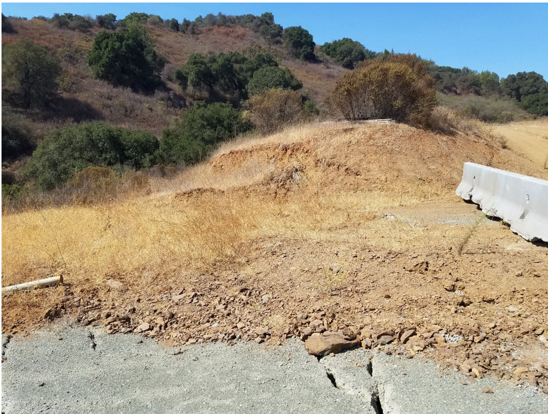
Photo 18: Ground cracks and headscarp beyond northwest property line.