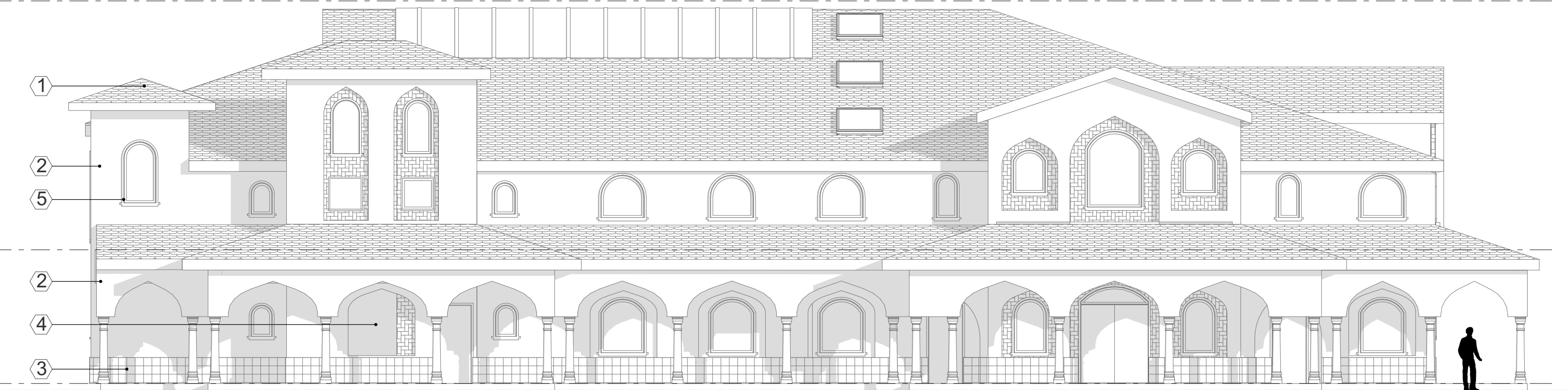
B SK3.2 COMMUNITY BUILDING WEST ELEVATION SCALE: 1/8" = 1'-0"