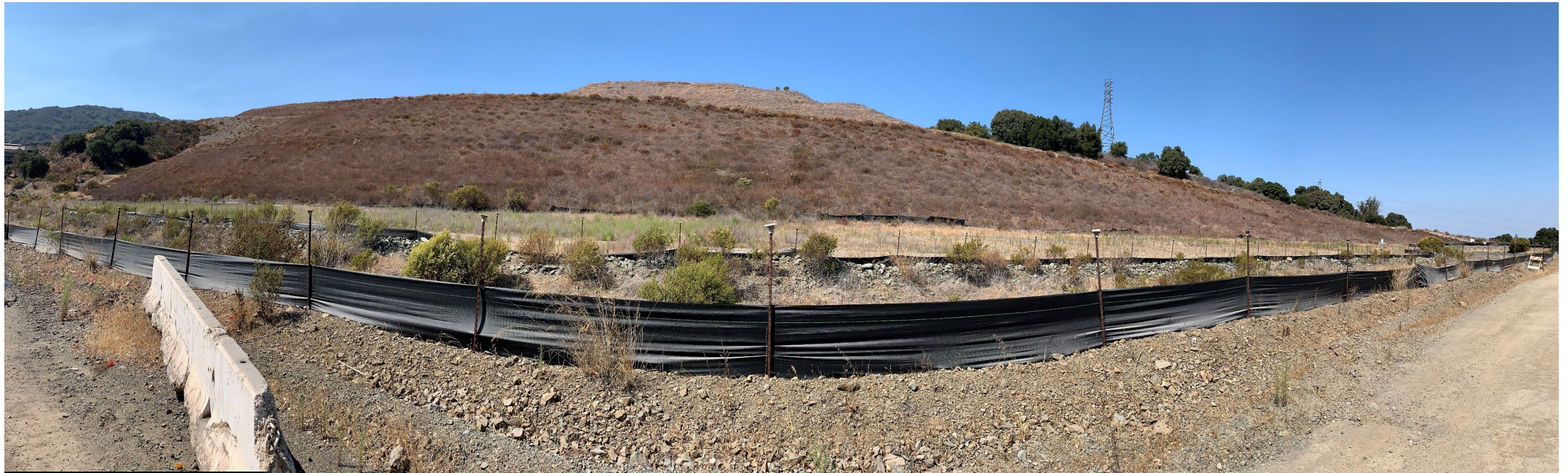
PHOTO #8 – Eastern slopes of EMSA, north of Pond 30 (looking northwest)