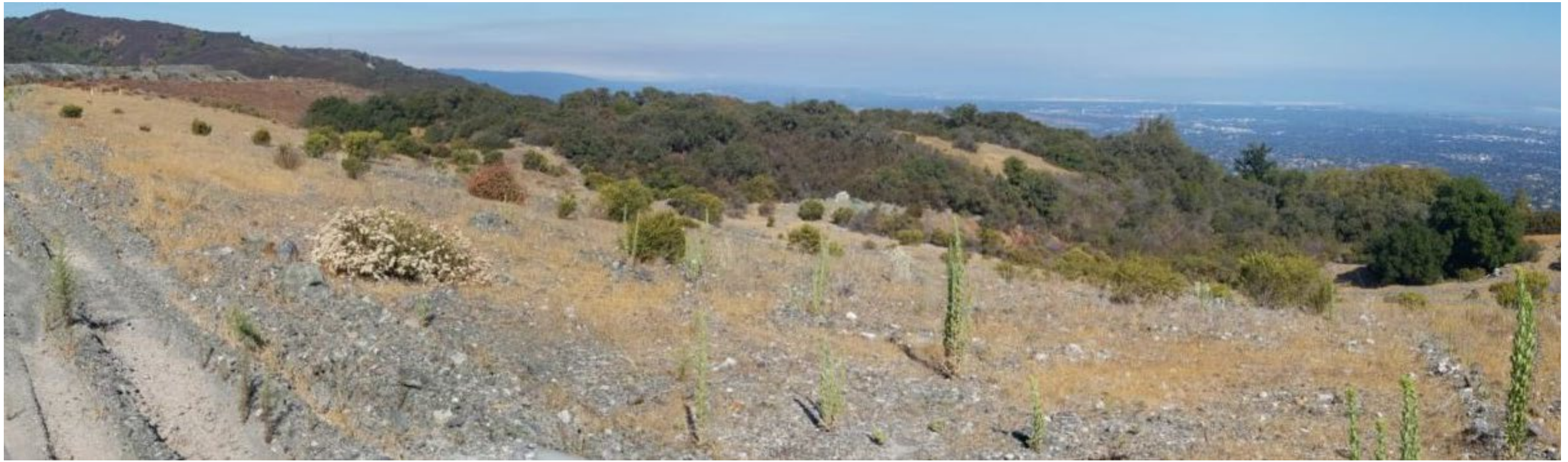
Map Location 2: West Materials Storage Area (WMSA)

The northeast-facing slopes of the WMSA have well-established vegetation (grasses and shrubs). [See PHOTO #3 and PHOTO #4 .]