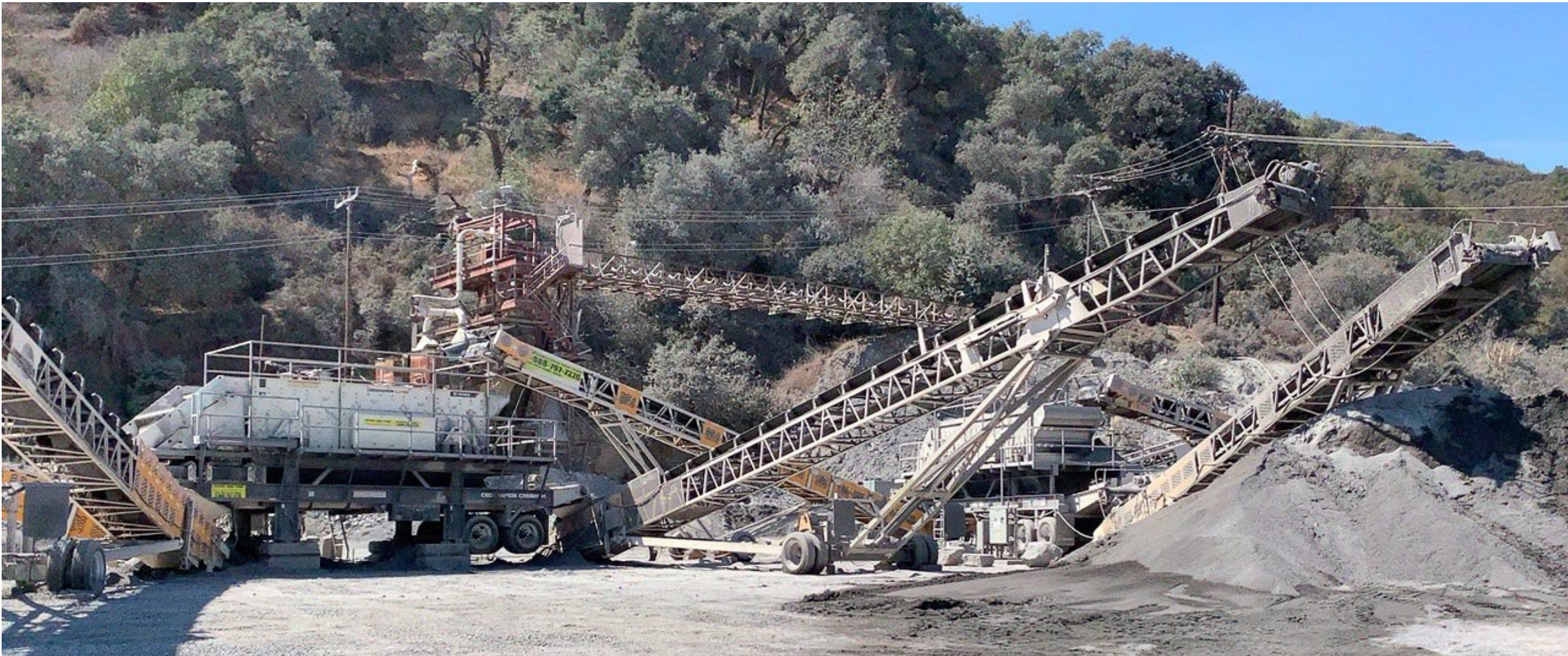
Map Location 6: Rock Plant

The rock plant did not appear to be operating during the inspection; however, it was active during portions of 2021. [See PHOTO #15 .] Runoff from the rock plant was previously being directed into Pond 17 [See PHOTO #16 ]. Pond 17 has been decommissioned and the runoff which was previously routed to Pond 17 now flows into a new basin in Permanente Creek installed at the direction of the San Francisco Bay Regional Water Quality Control Board.