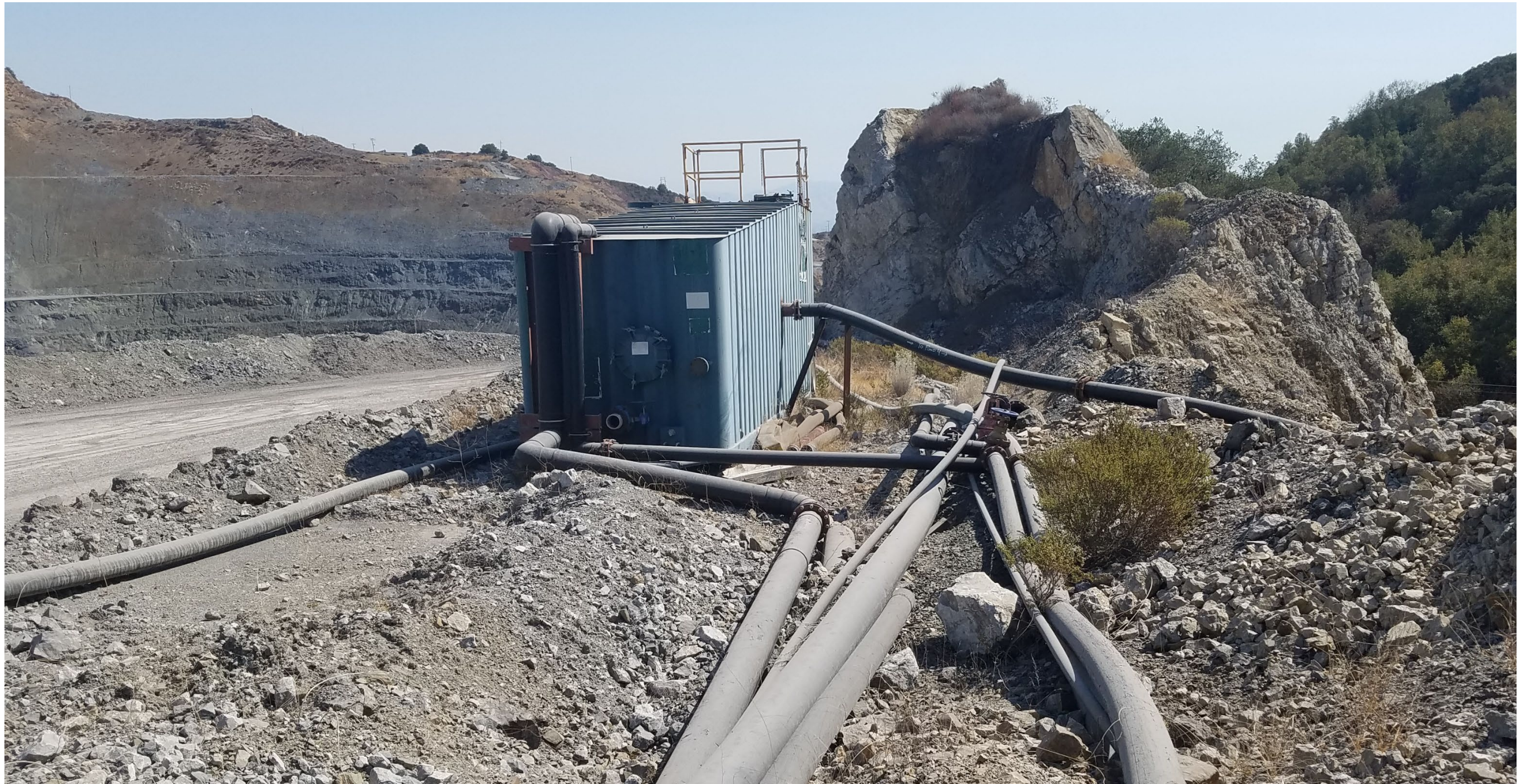
A portable blending tank is located on the bench above former Pond 4A.