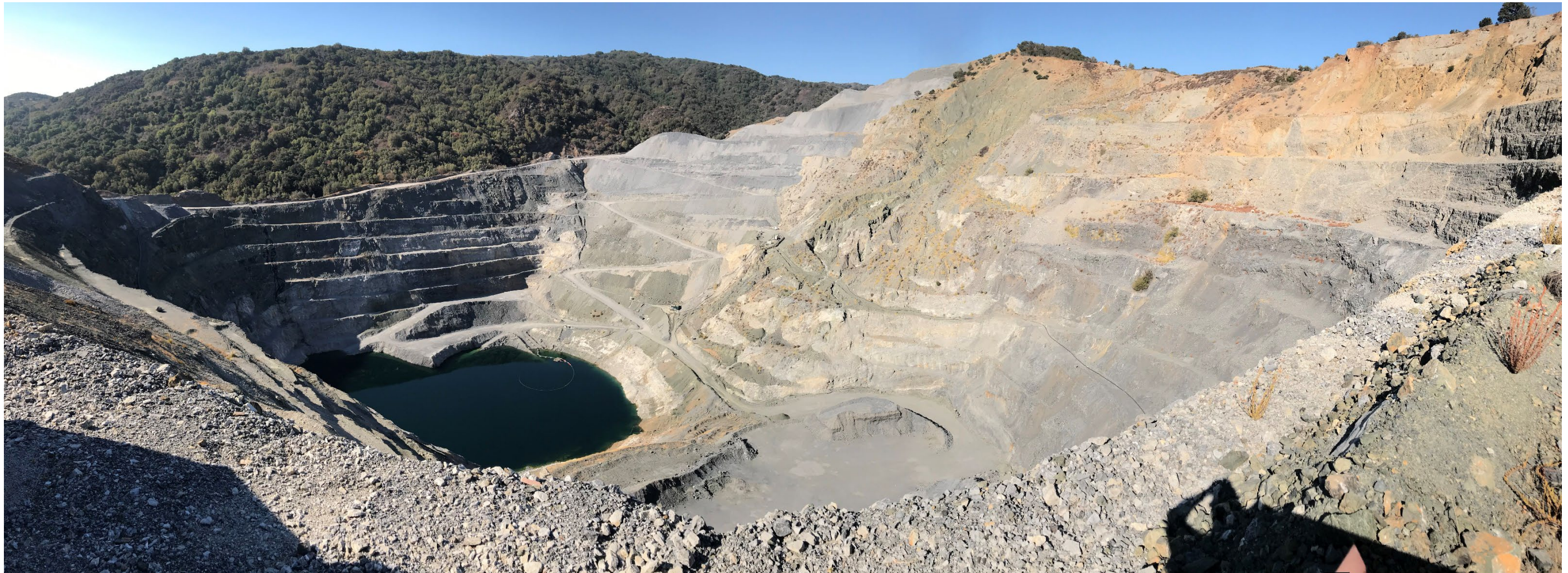
Map Location 1: North Quarry (Main Pit)

The highwalls on the north, east, and south are essentially complete (excavated benches); while the southern side of the pit is still being actively mined (blasting and loading). No extraction of limestone was occurring during the inspection New material was being placed on the southern portion of the WMSA [See also PHOTO #2. ]