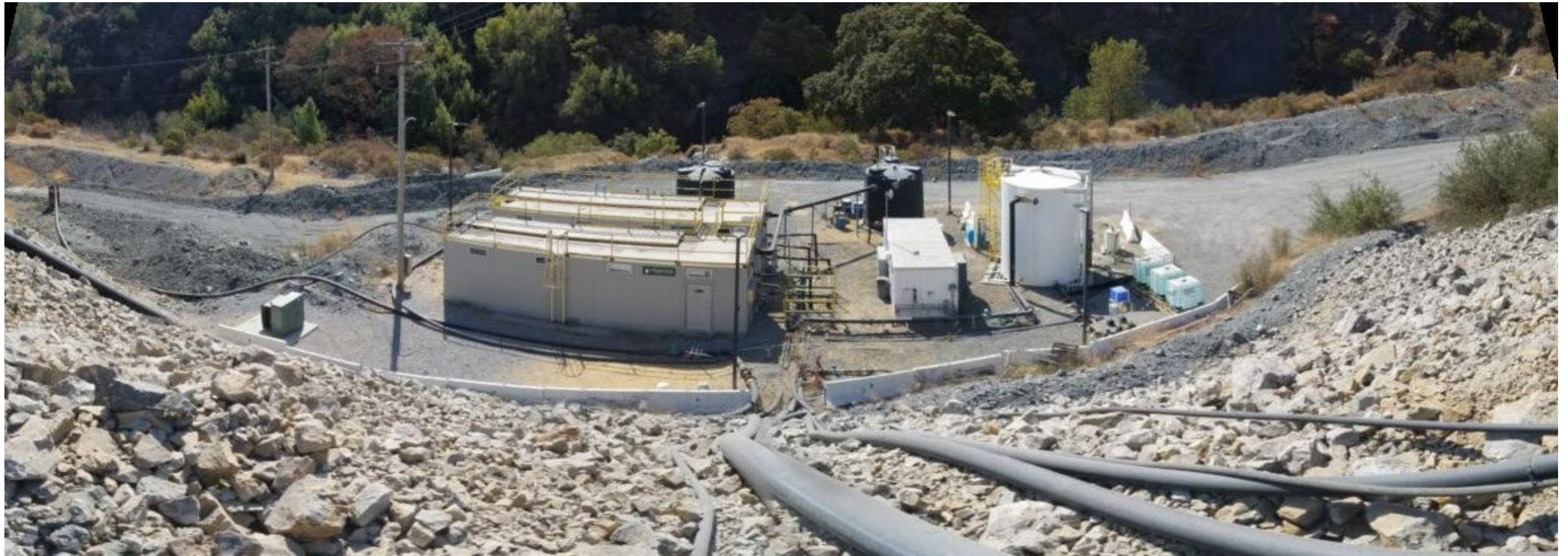
#18 – Treatment System near former Pond 4A