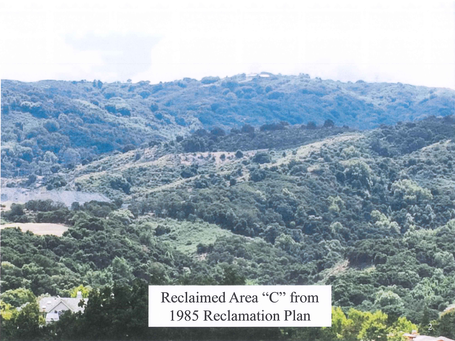
Reclaimed Area "C" from 1985 Reclamation Plan