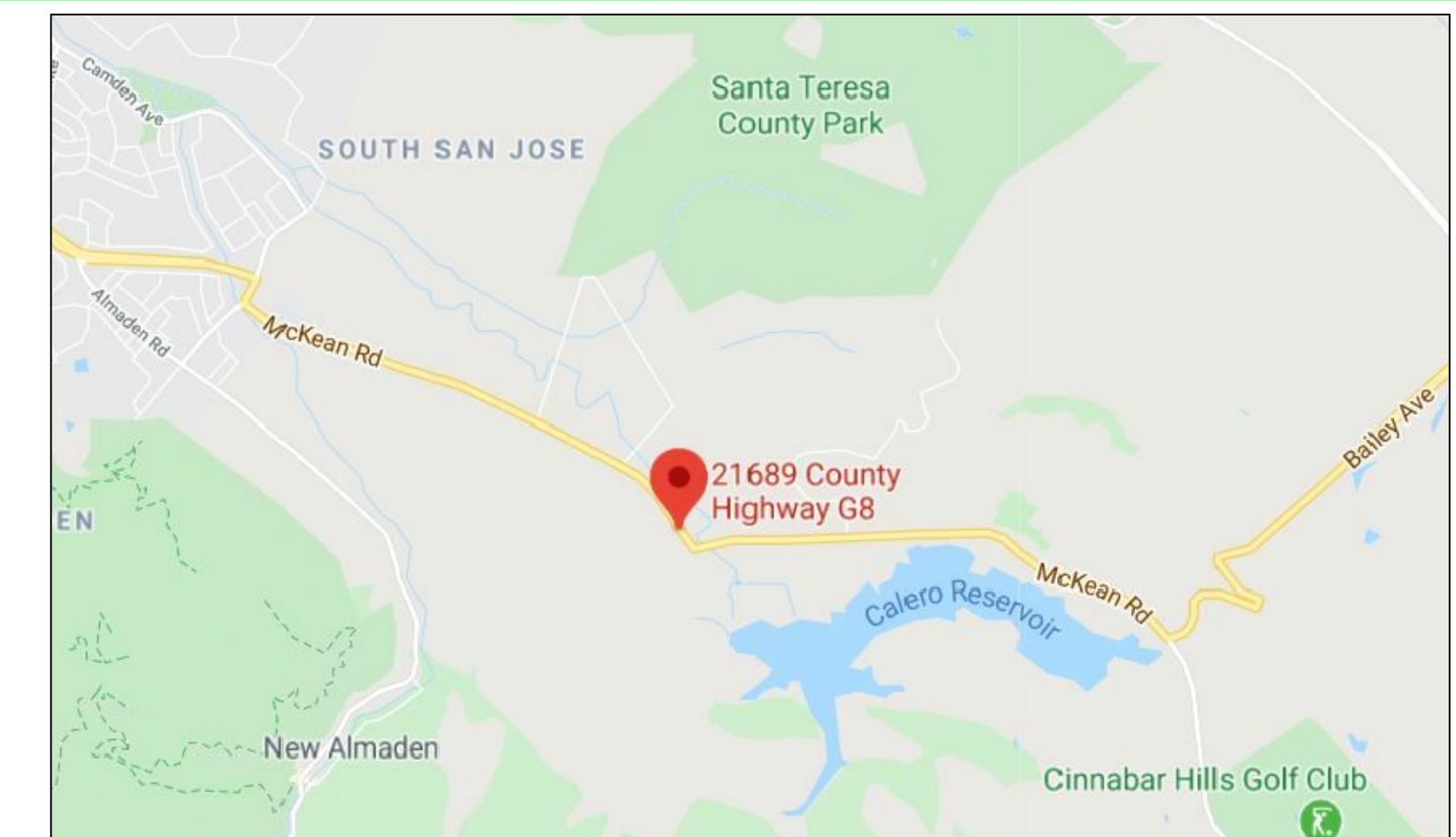
LOCATION MAP NTS