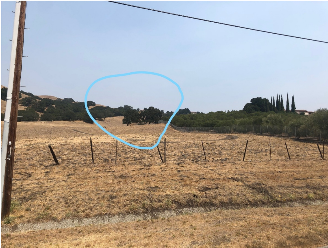
View further north on Paseo Robles, vegetation fully blocks story poles.