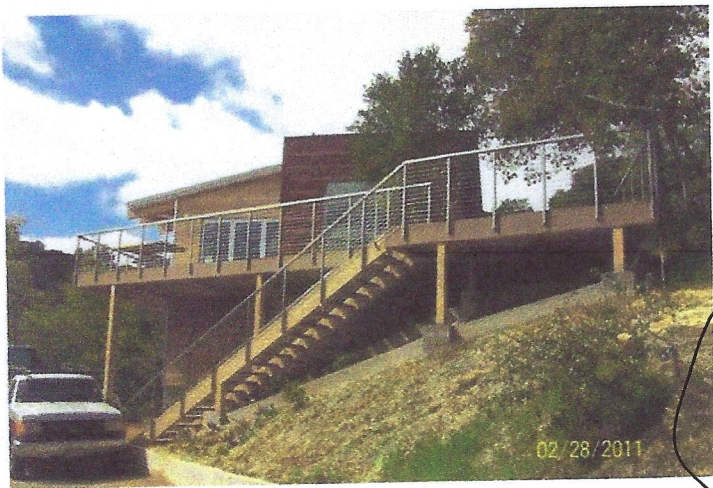
PHOTO 5: On sloped lots, design residences that are tiered and are appropriate for the natural setting.