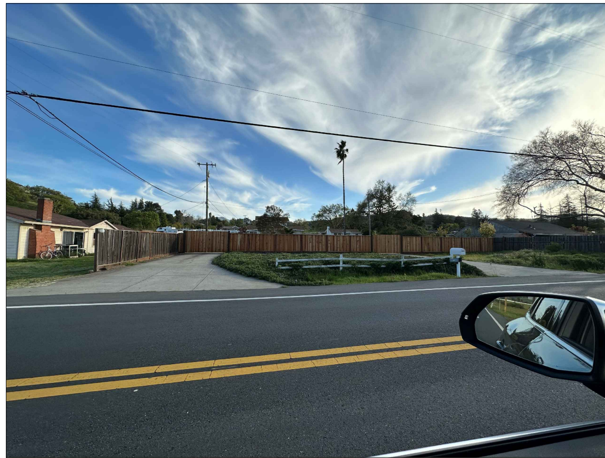
4 PROPERTY IMAGE NO SCALE