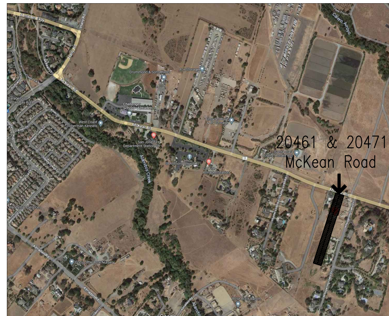
2 VICINITY MAP NO SCALE