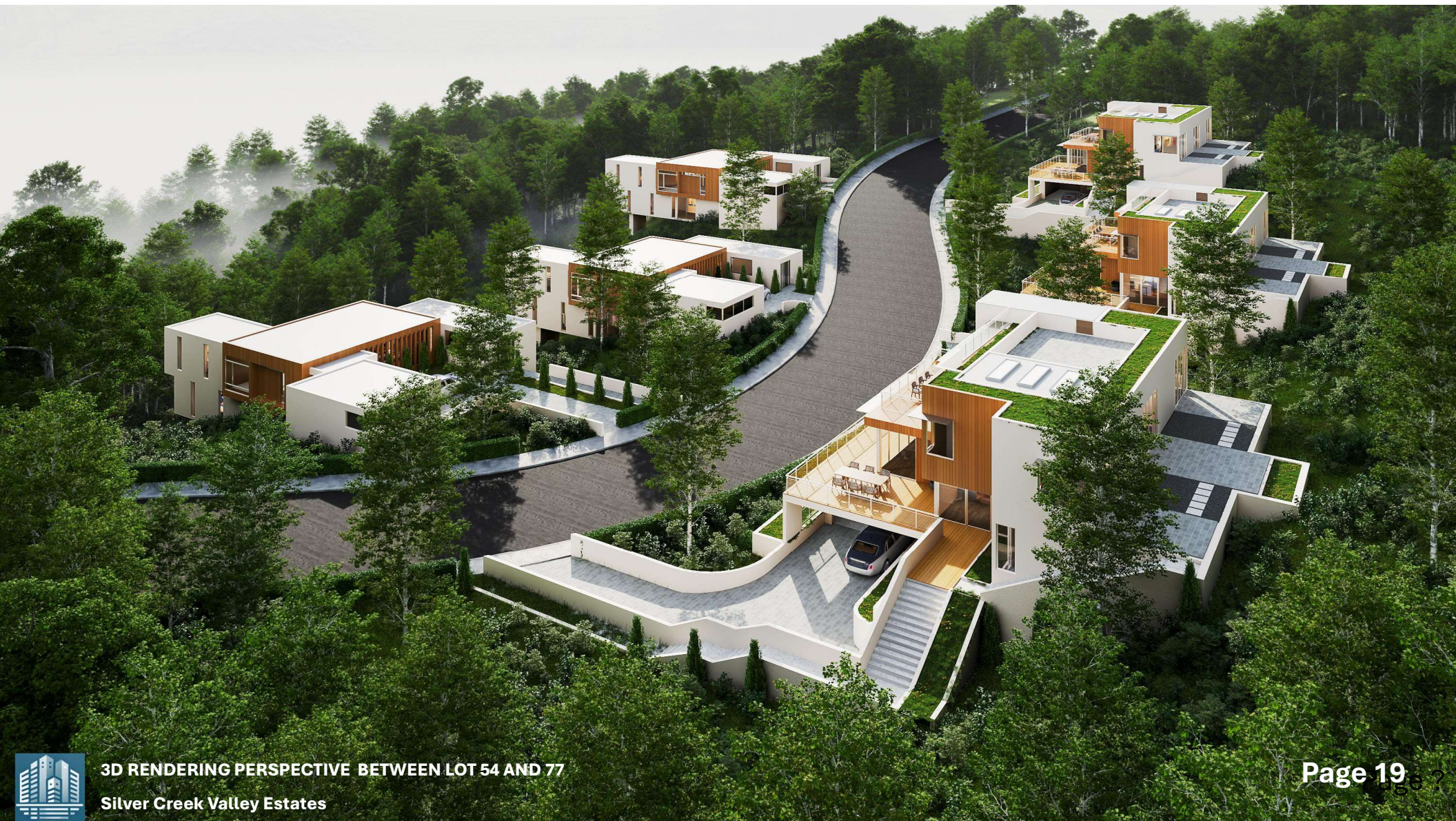
3D RENDERING PERSPECTIVE BETWEEN LOT 54 AND 77 Silver Creek Valley Estates