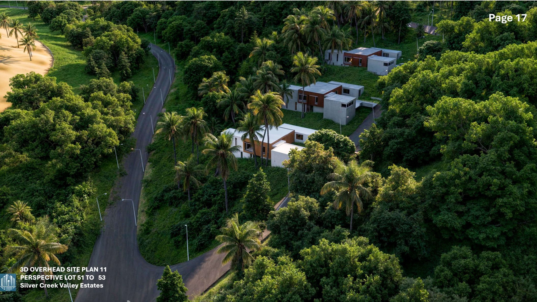
3D OVERHEAD SITE PLAN 11 PERSPECTIVE LOT 51 TO 53 Silver Creek Valley Estates