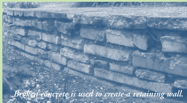
Broken concrete is used to create a retaining wall.